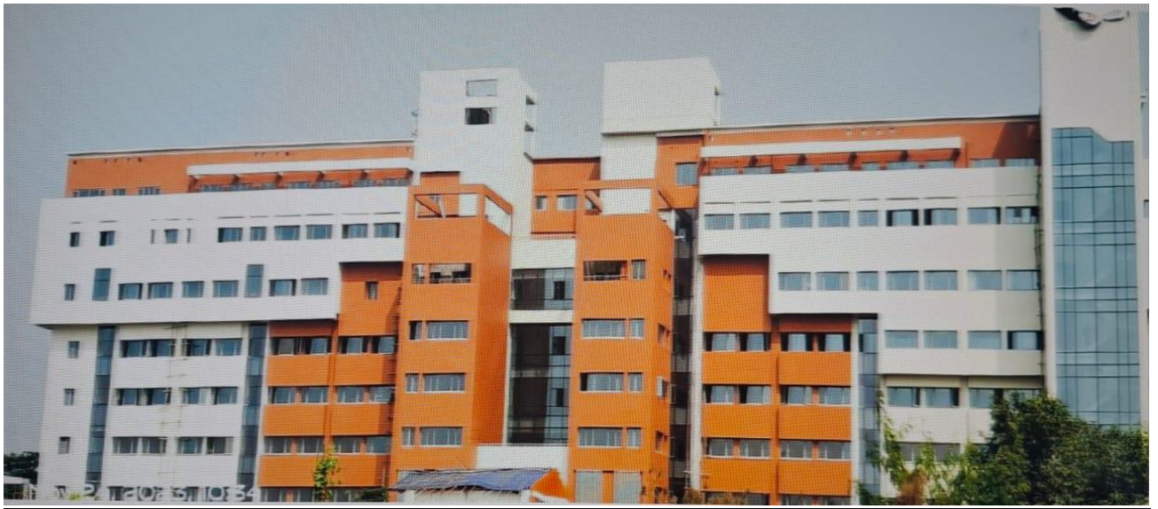
Bharat Sevashram Sangha Hospital, Joka, Diamond Harbour, Phase – 2