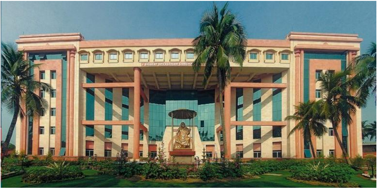
Bharat Sevashram Sangha Hospital, Joka, Diamond Harbour, Phase – 1