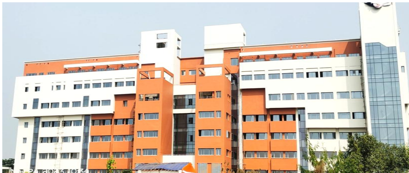
Bharat Sevashram Sangha Hospital, Phase – II Building

Diamond Harbour Road, Joka, Kolkata - 700104